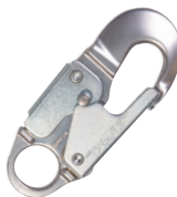
Aluminum Snap Hook 3/4" (19.1 mm) Gate Opening