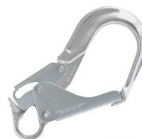
Aluminum Rebar Hook 2-1/2" (63.5 mm) Gate Opening