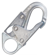
Steel Snap Hook 3/4" (19.1 mm) Gate Opening