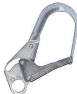
Steel Rebar Hook 2-1/2" (63.5 mm) Gate Opening