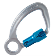
Aluminum Captive Eye Caribiner 0.86" (22 mm) Gate Opening