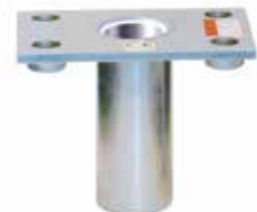
■ Flush Floor Mount Sleeve DH-20ZP/ & DH-20SS/

Designed for applications involving frequent set-ups over similarly-sized access openings. Simply slip collar into sewer manhole, tank hatch or other opening.