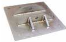
■ Bolt-on Anchor Plate For use in concrete or steel applications (Portable or Permanent) DH-AP-12/