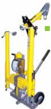
■ DuraHoist Equipment Cart DH-18/