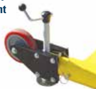
■ Wheel Kit for DuraHoist Three-Piece Base DH-4WK/