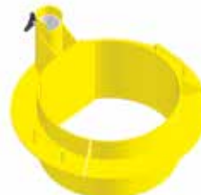
■ Manhole Collar DH-11/

Designed for slip-in installation into a 4-in. (.10m) diameter core hole in concrete or in an existing steel structure.