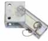
■ Single Direction Bumper Receiver DH-17/