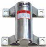
■ Wall Mount Sleeve DH-8ZP/ & DH-8SS/

Mounts to horizontal concrete or steel structures.