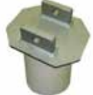
■ Plate for Inclined Surfaces DH-AP-7/