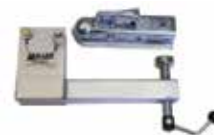
■ 2-in. (.05m) Ball Hitch Adapter DH-16/